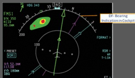
DF Bearing in cockpit on HSI

In addition, the pilots can use the AeroFIS® flight guidance interface to the EFIS for flying search patterns with the autopilot.